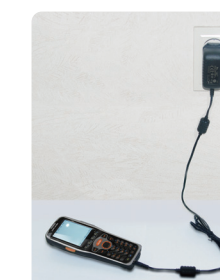
Using AC/DC Power Adapter